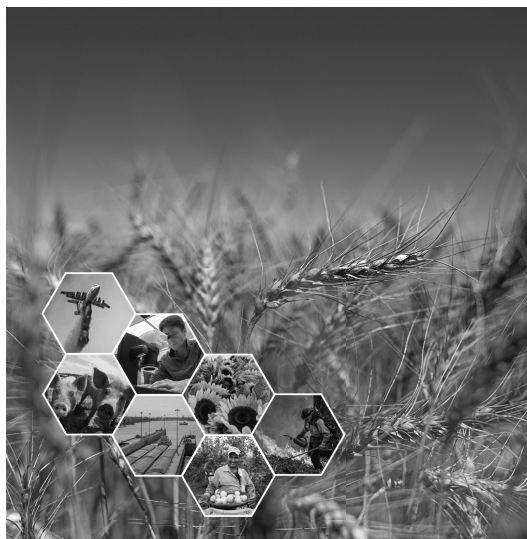
Collage of images in seven hexagon shapes with white borders: fire-fighting airplane, scientist looking into a microscope, two pigs, shipping containers on a river, sunflowers, a firefighter in a forest, and a migrant harvester.

Report 60026-0001-21 October 2019 Office Of Inspector General