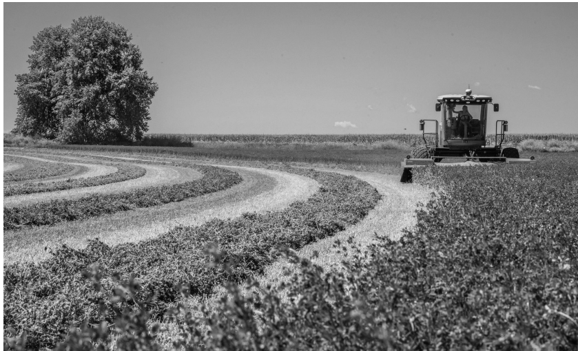
Photograph of a field and a woman driving [a] tractor on the right side.