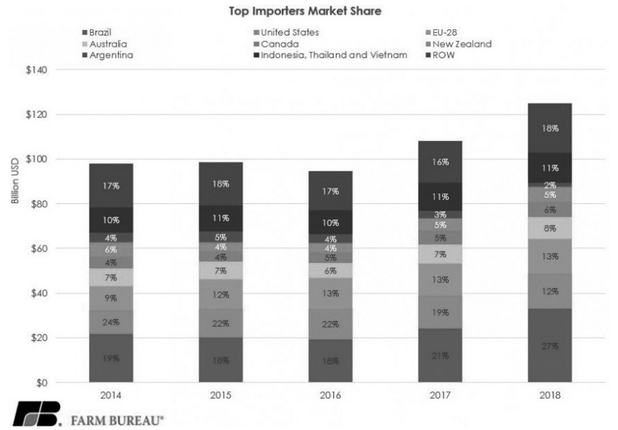
Figure 1. China's Total Agricultural Imports by Value

In order to properly consider whether $40 billion is achievable, it is important to understand how the U.S. fits in China's overall agricultural import landscape. (For the purposes of discussing overall agricultural imports, the more traditional definition of agriculture, which does not include distilled spirits, ethanol and seafood, is used.) From that perspective, the U.S. is a top-five supplier of agricultural imports to China but has not been the top exporter since 2016. Figure 1 highlights that the top role has belonged to Brazil since 2017 and that competition for Chinese consumer dollars is fierce. In 2018, Brazil, the EU 28, the United States, Australia, Canada, New Zealand, Argentina, Indonesia, Thailand and Vietnam accounted for 82% of China's lucrative $124 billion agricultural import market. The rest of the world split the remaining 18%. (Full 2019 Chinese import data was unavailable at the time of this statement; therefore, 2018 is used instead.)