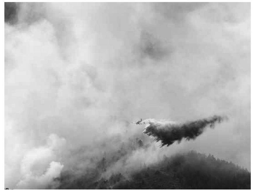
The cost of fire suppression continues to increase, as budgets remain relatively flat, which results in the need to transfer funds from non-fire to fire accounts when budgeted funds are insufficient.

L1B: Address the associated impacts of wildfire funding on Federal natural resource management capacity, planning and project implementation. Ensure budget actions continue to support state wildfire and forestry capacity, including the USFS State and Private Forestry programs.