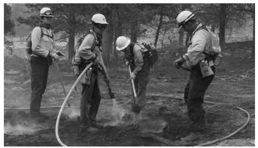
Firefighters on the 2002 Hayman Fire, whose long-term impacts dramatically affected water quality and supply for the Front Range of Colorado.

Soil health impacts from uncharacteristic catastrophic wildfires along Colorado's Front Range, including the 1996 Buffalo Creek and 2002 Hayman wildfires, have led to severe erosion and sediment accumulation in reservoirs supplying drinking water for the greater Denver area.