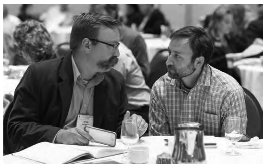
Nearly 400 attendees from across a wide spectrum took part in the regional workshops held in Montana, Idaho, South Dakota and Oregon. Priority 4: Strengthen and expand high impact programs:

L3F: Resolve outstanding issues with potential requirements to reinitiate endangered species consultations following the adoption, amendment or revision of an appropriate management plan.