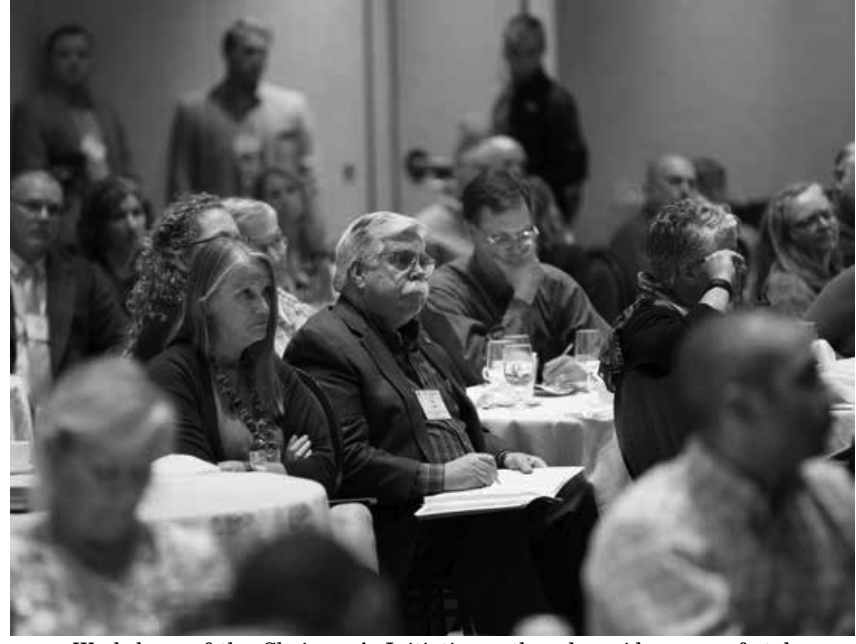
Workshops of the Chairman's Initiative gathered a wide array of stakeholders at workshops in Montana, Idaho, South Dakota and Oregon.