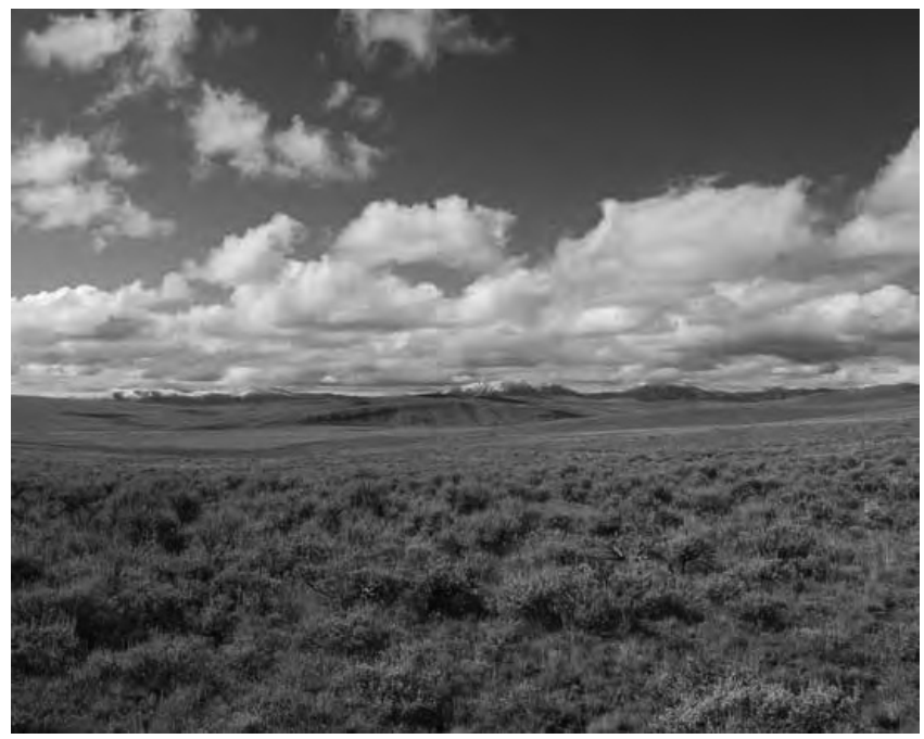
Rangelands support a wide range of multiple uses, from livestock production and recreation to wildlife habitat and water quality values, across Federal, state and private ownerships.

A11: Target funding from USFS, BLM, Natural Resources Conservation Service (NRCS) and state sources to address cross-boundary management goals (and support monitoring and assessment frameworks) in priority areas. Projects using this targeted funding should be consistent with State Forest Action Plans, wildlife action plans, community-wildfire protection plans and projects in other priority areas determined by Federal, state, local and Tribal partners based on the best available science.