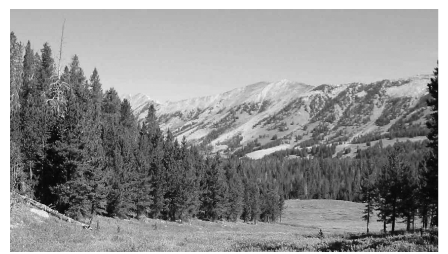
The Custer Gallatin National Forest, Montana.