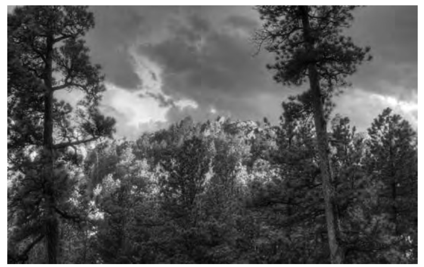
Black Hills Forest, South Dakota.

South Dakota's effort to address Mountain Pine Beetle (MPB) infestation is an excellent example of successful cross-boundary management: