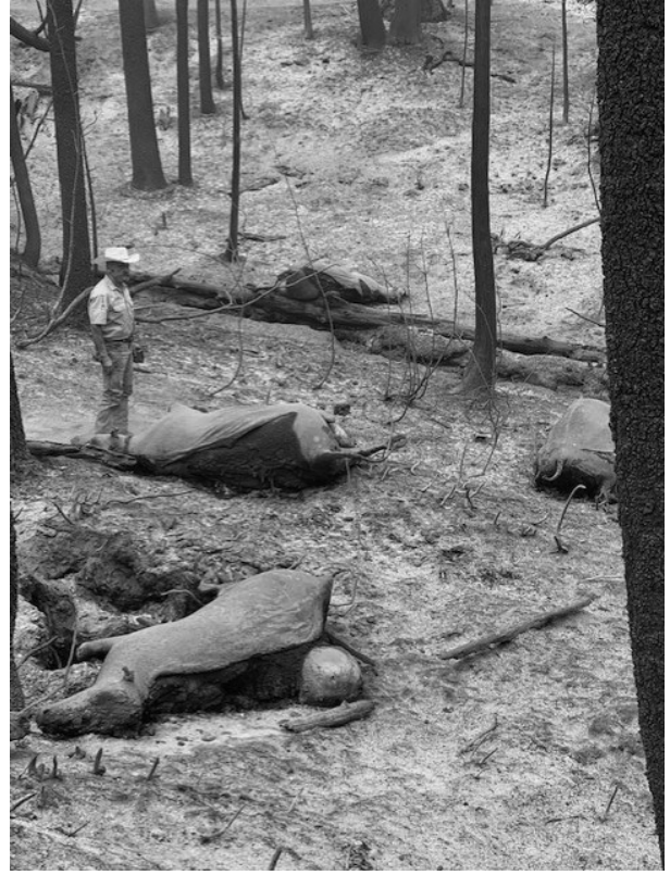
Rancher observing damage to land, cattle and legacy, post fire.