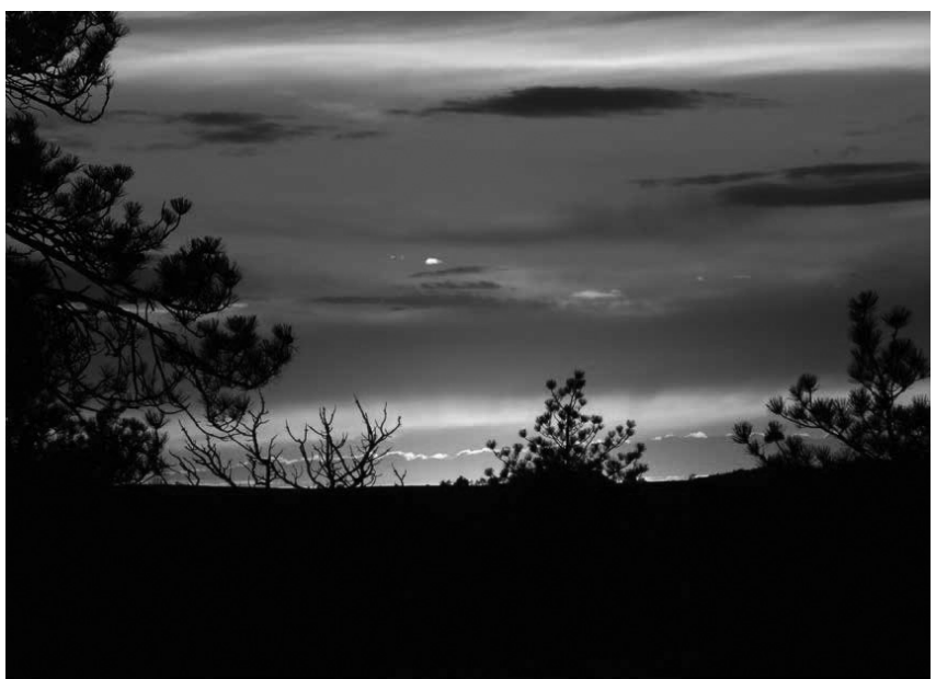
The benefits of healthy forests and rangelands include the protection of environmental values and the promotion of sustainable economic opportunities.

A3D: Incentivize local governments to take voluntary actions to support the creation and expansion of fire-adapted communities and resilience, including the promotion of education, fuels management projects and improved integration of community wildfire protection plans with land use decisions when compatible with local goals. Provide additional analyses to help communities evaluate the full costs of suppression associated with development in the wildland urban interface (WUI).