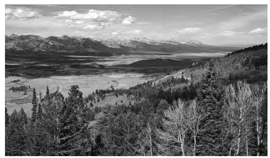
Sawtooth Valley, Idaho.

Idaho has been recognized as a state leader in the use of GNA and is using the authority to achieve a number of different restoration objectives.