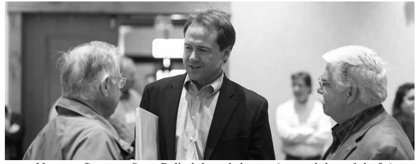
Montana Governor Steve Bullock hosted the opening workshop of the Initiative in Missoula. He urged attendees in a keynote to "take a hard look at collaboration. What makes it succeed? Why does it fail? It's a discussion that will set the stage and tone for more hard work to follow."

Priority 1: Invest in all-lands/cross-boundary management opportunities (all partners):