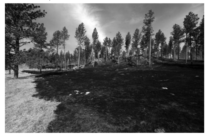
The North Pole Fire burned roughly 60 acres of ground Tuesday west of Custer. Strong winds from the south drove the fire. but most of the burning was contained to the grass and didn't get into the tree canopy.