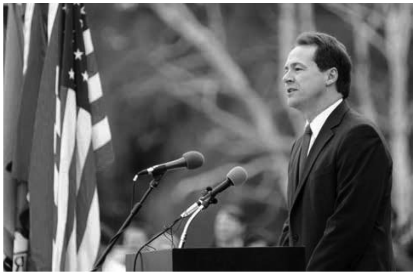
Montana Governor Steve Bullock launched the National Forest and Rangeland Management Initiative to bring states, Federal land managers,